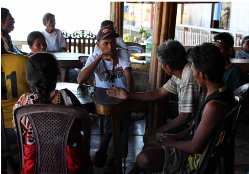
Above, Tagbanwa leaders discuss program flow and review of committee tasks After which workshop 1 followed.