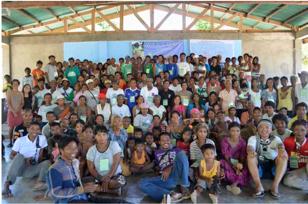
Above, participants pose for posterity with the KASAPI Secretary General. Below, a Tagbanwa sunrise ritual signals the start of the assembly.