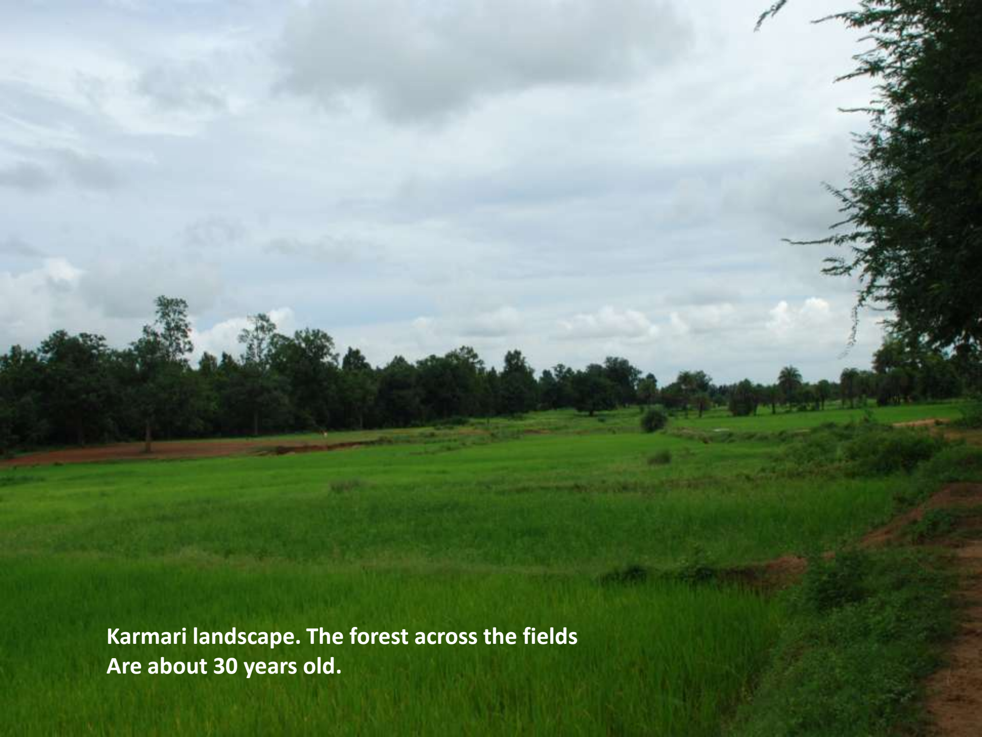
Karmari landscape. The forest across the fields Are about 30 years old.