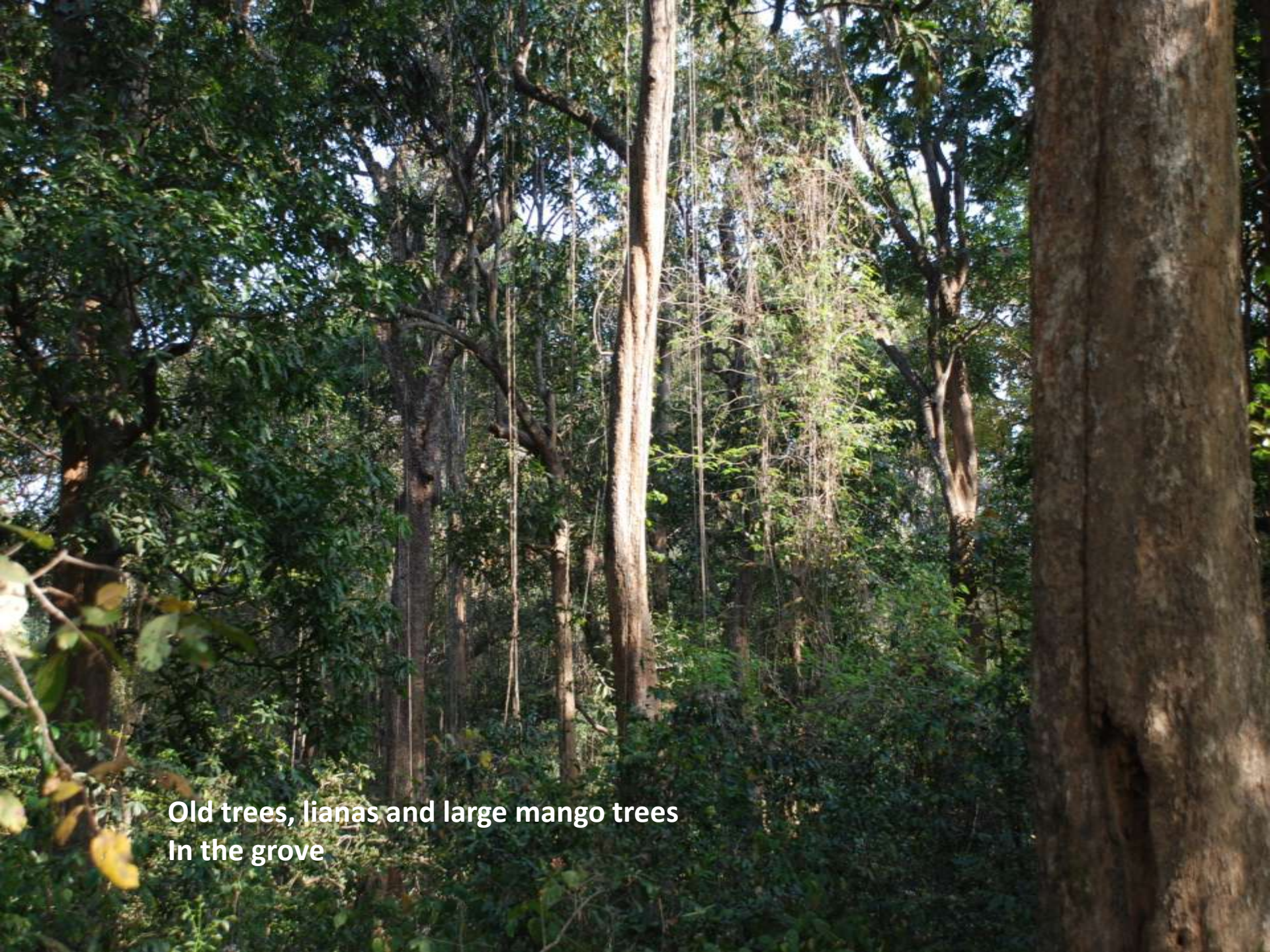
Old trees, lianas and large mango trees In the grove