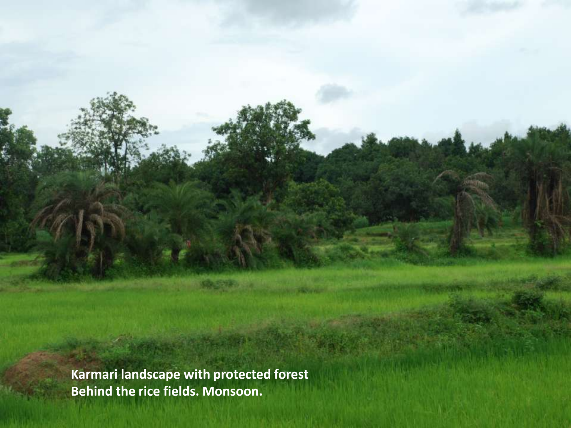
Karmari landscape with protected forest Behind the rice fields. Monsoon.