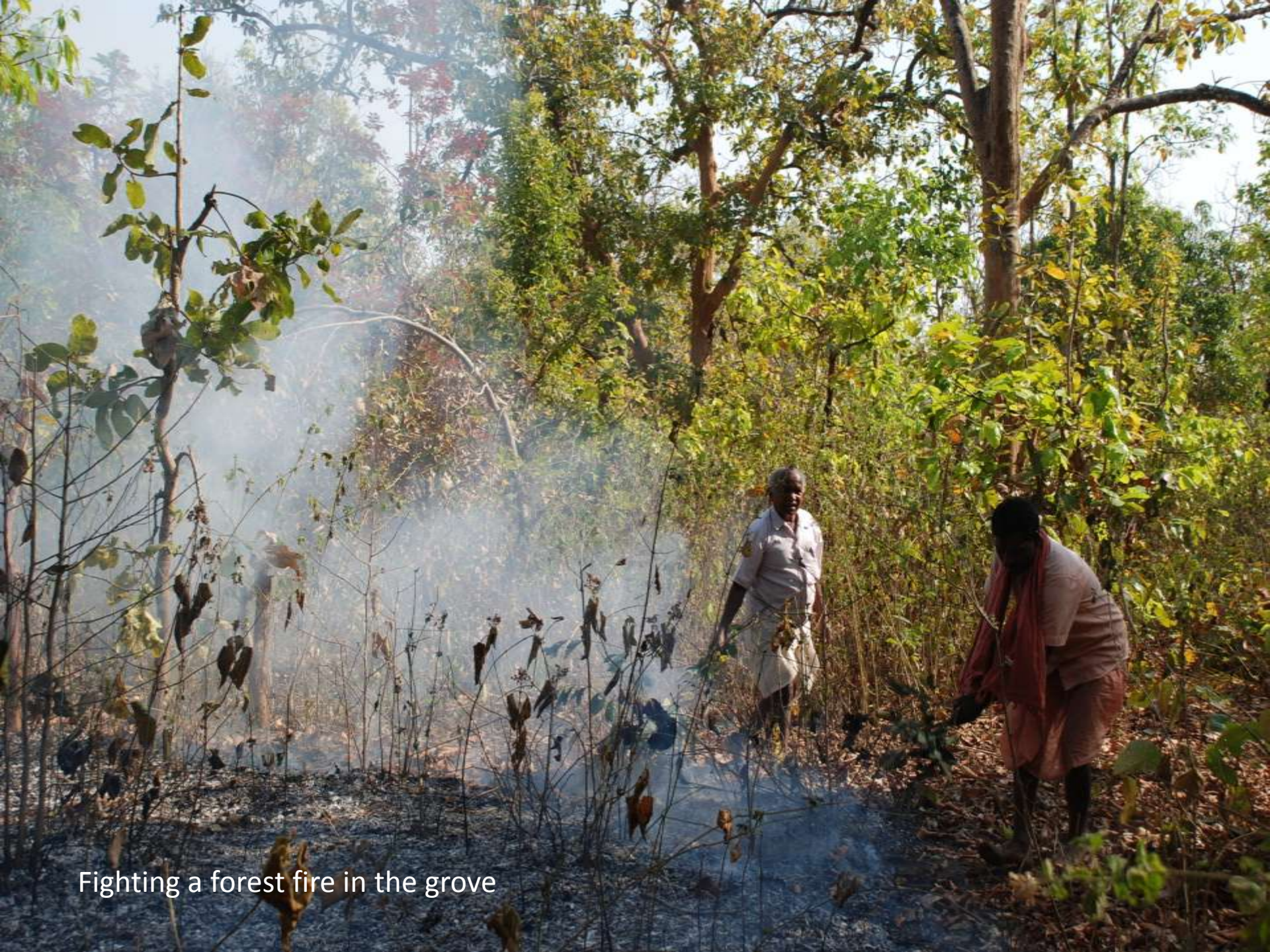
Fighting a forest fire in the grove