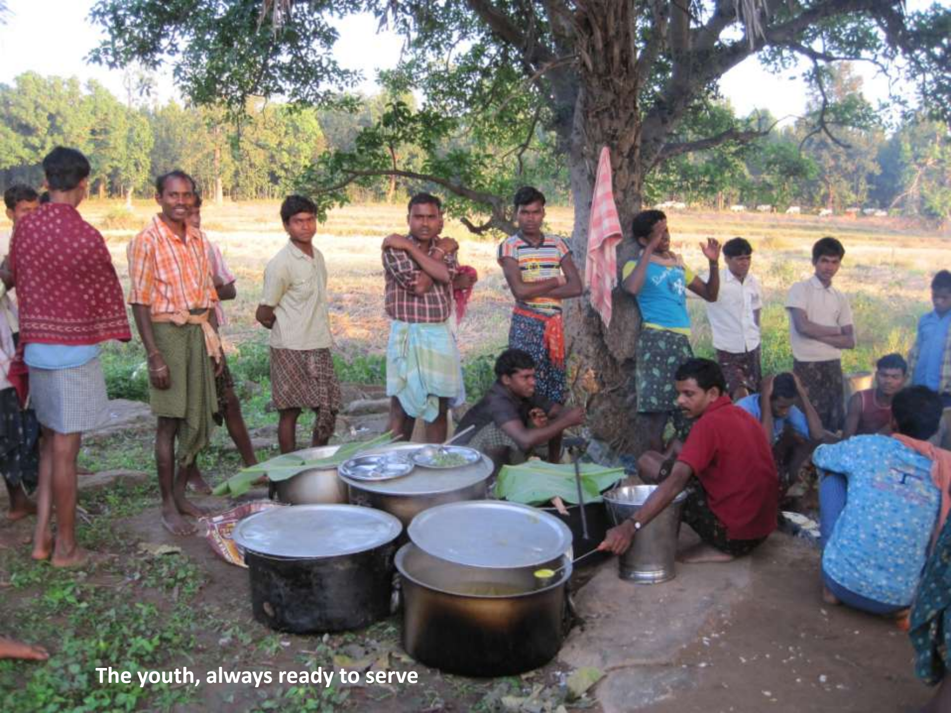
The youth, always ready to serve