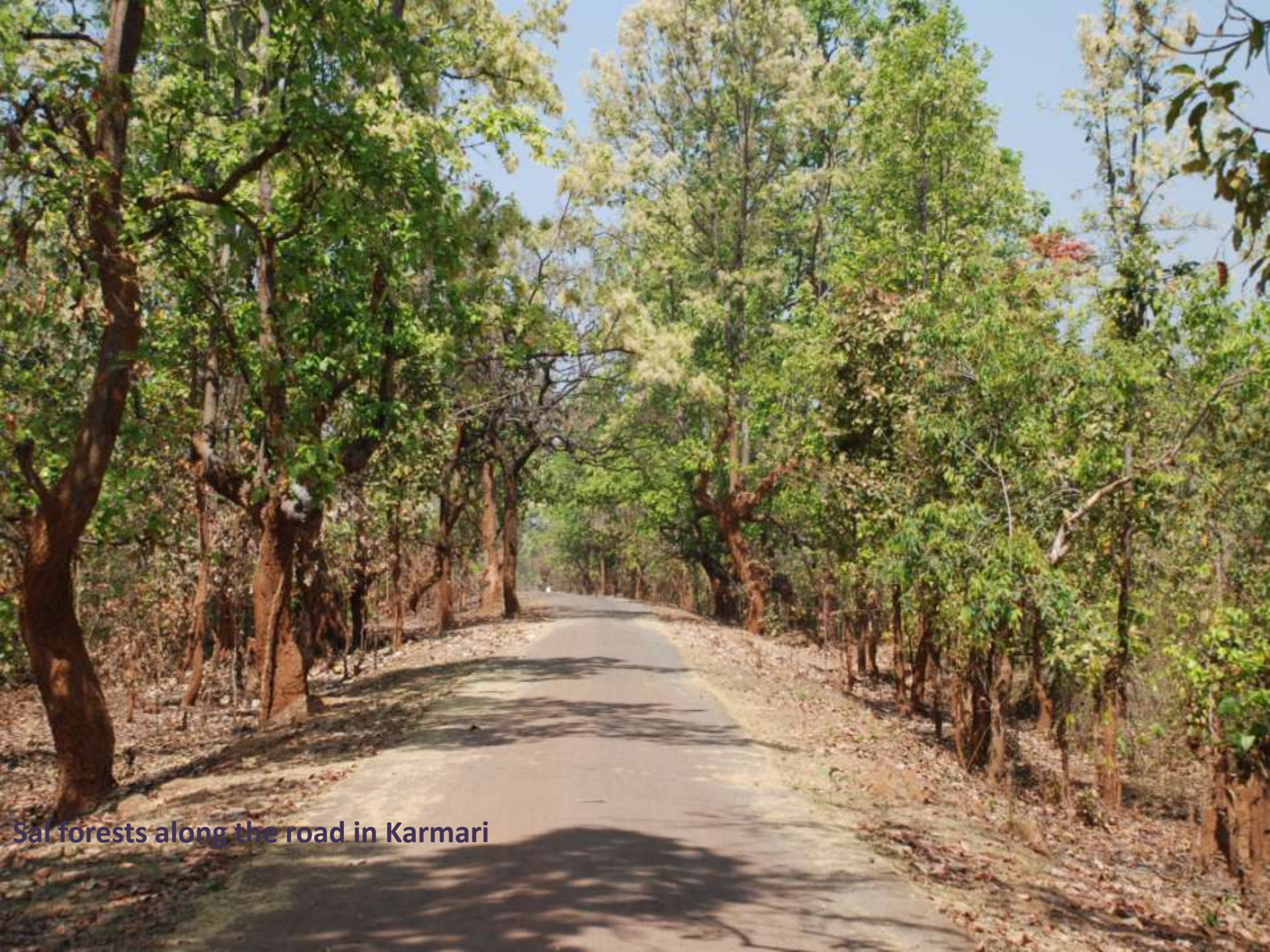
Sal forests along the road in Karmari